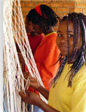
Throughout the school the pupils work on age-appropriate practical tasks

Through active participation in arts and crafts children learn to perceive with all their senses, to rediscover themselves and the world around them. The children learn eurythmy, music, drawing, painting, sculpting, gardening, woodworking and book-binding. Drama also plays an important part in our school life with regular performances.