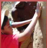
Heart, Hands and Mind

Our school strives to offer pupils a full 12-year Waldorf curriculum which also fulfills the requirements of the Namibian educational authorities. The grade 13 is designated to prepare and write the Namibian Senior Secondary Certificate (NSSC).